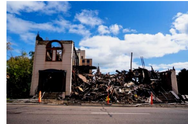
Little remained of Duluth's nearly 120-year-old Adas Israel Congregation synagogue after it was gutted by fire early Sept. 9.